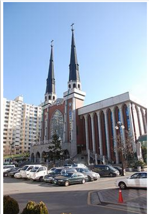
The church in 2008